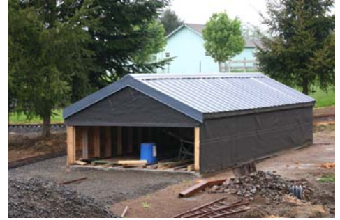
New car barn for the Soggy Sod Railroad, built by Frank Lertora. Will have 4 tracks, to store 12, six foot cars.