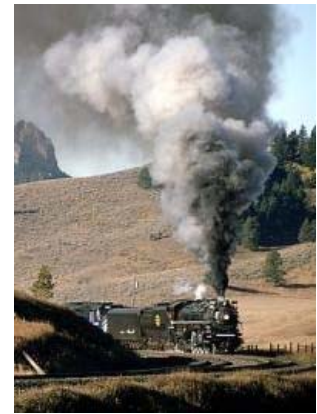
Bozeman Hill, MT, Oct 14, 2002

www.sps700.org www.oregonol.org www.willowcreekrr.org